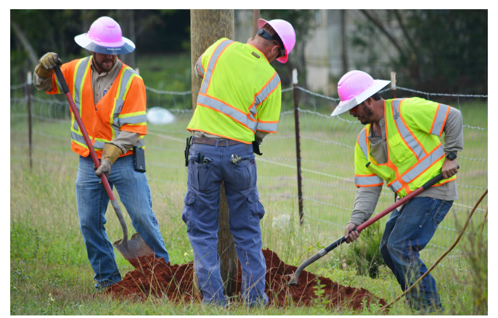
A crew packs dirt around a newly-placed pole while wearing pink hard hats to support those who have fought and are currently fighting breast cancer.